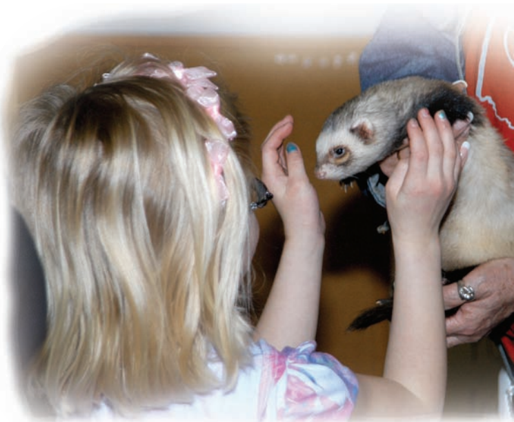
This little girl wanted to pet the ferret.

You may well sense the excitement, just as I did when I heard the roar of the crowd from inside as I approached the building. Lots of people were headed inside, their own pet in hand. Yes, you are welcome to bring your own pet, as long as it's well-behaved, a year or older, up-to-date with its shots and in a pet-friendly enclosure such as a stroller (see the Web site for a complete list of rules and to obtain a liability waiver that must be signed).